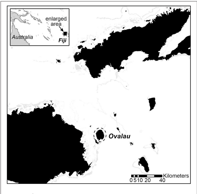
FIGURE 1 | Map of Fiji and research area.

In Solomon Islands the constitution and fisheries legislation also recognize customary rights. Diverse socio-cultural, historic and economic processes have created differential and contested territorial customary rights systems. As a result, customary marine tenure systems vary regionally and are generally more stratified, decentralized and politically eclectic than in Fiji (Aswani, 1997, 1999).