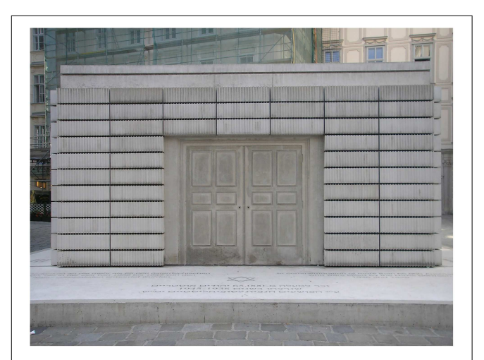
FIGURE 10 | Rachel Whiteread, Judenplatz Holocaust Memorial , 2000, Concrete, Judenplatz, Vienna. Image source: Wikimedia Creative Commons. http://commons.wikimedia.org/wiki/File:Holocaust_Mahnmal_Vienna_Sept_2006_001.jpg. By Gryffindor