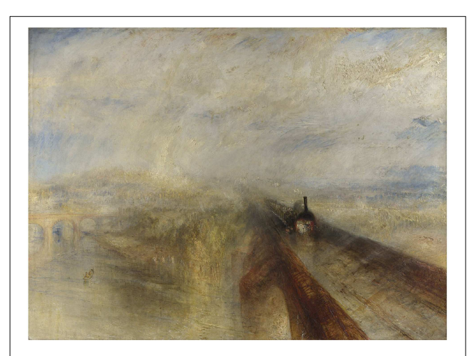
FIGURE 2 | Joseph Mallord William Turner, Rain, Steam, Speed: The Great Western Railway, 1844, Oil on Canvas, National Gallery, London. Turner Bequest, 1856. ©The National Gallery, London.

It is not only pictures that are dichotomous in this way. When looking at the sculpture made by Pablo Picasso in 1942 titled Bull's Head ( Figure 4 ) either in person or in reproduction, we perceive a bull-like form and bicycle parts.<sup>2</sup> Picasso was clear