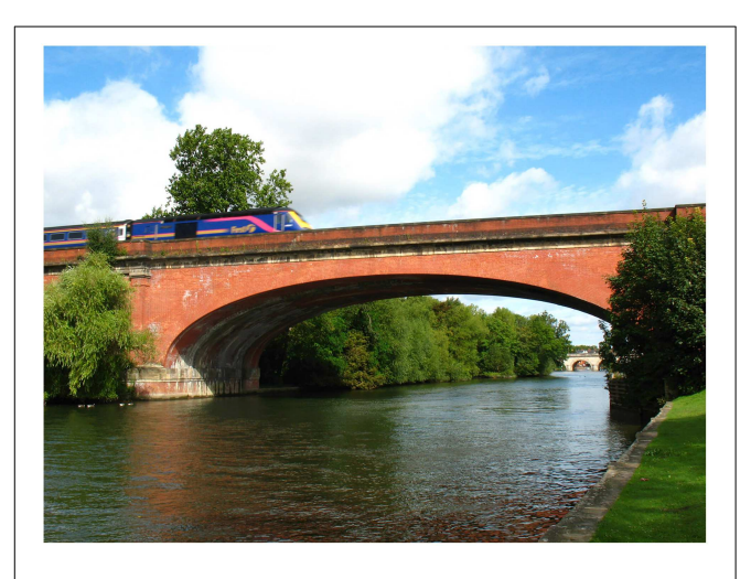
FIGURE 11 | Photograph of a train crossing Maidenhead Bridge.

For many people, of course, the Jansch sculpture will be aesthetically preferable to the Picasso precisely because the