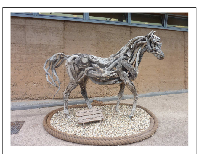
FIGURE 12 | Photograph of a sculpture of a horse made from driftwood by Heather Jansch.

arrangement of matter follows more closely the expected form of a horse. In this sense it is more "realistic" or recognizable, and appears to show greater evidence of skill in its construction. It is probable that the level of expertise of the viewer will be an important factor in this judgment, with art experts being inclined to favor the Picasso because it places greater demands on imaginative resources and because it has deeper poetic resonance (the leather of the seat evokes the skin of the animal, we think of holding the handle bars and "taking the bull by the horns," of Picasso conjuring up a potent symbol of Spanish vitality from the among the privations of wartime Paris, etc.). For all its skilful construction, the wooden horse fails to ignite as many diverse associations, and therefore ranks as a lesser work of art.