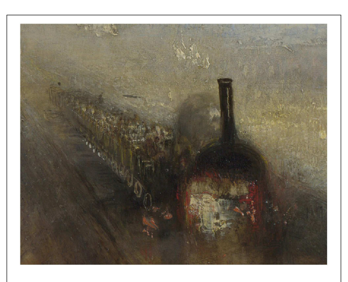
FIGURE 3 | Detail from Joseph Mallord William Turner, Rain, Steam, Speed: The Great Western Railway.

about the importance of this dichotomy to the aesthetic impact of the piece: