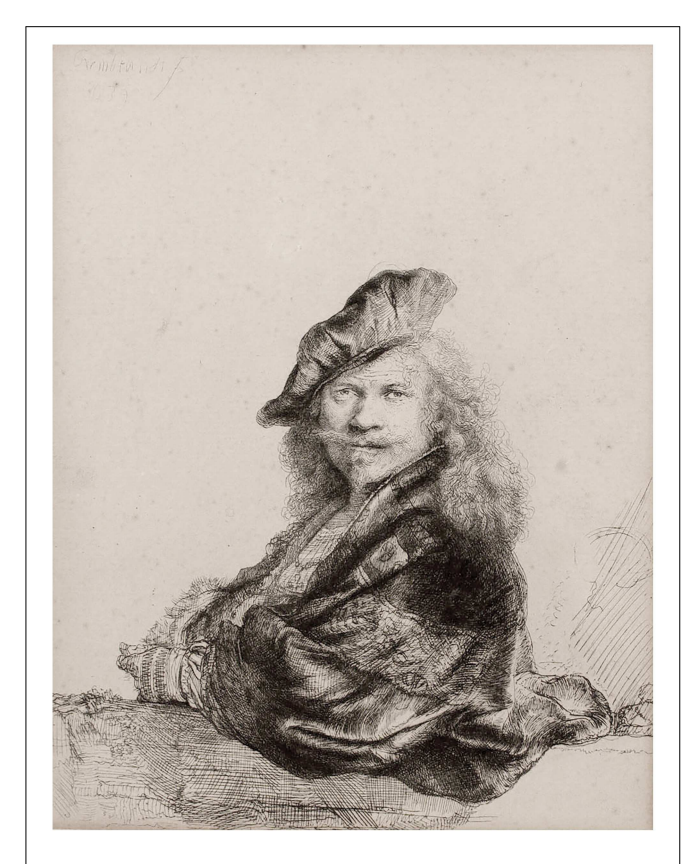
FIGURE 1 | Rembrandt van Rijn, Self-portrait leaning on a stone sill, 1639, etching on paper. Photograph of a reproduction owned by the author.

Turner's Rain, Steam, Speed (National Gallery, London, 1844, Figure 2) presents us with a mass of vigorously applied paint, the handling of which pronounces its material properties. We also see a locomotive engine pulling carriages across the Maidenhead Railway Bridge through heavy rain. The paint here functions both as matter spread over a surface and as sky, brick, steam, metal, water, clouds, and fields. The dichotomy is more evident when the work is seen in person because the materiality of the surface "interferes" with our recognition of the forms. This can be witnessed to some extent in the detail of the painting shown in Figure 3. Seen at closer quarters the engine hovers between appearing as solid metal and buttery paint and the poor passengers in the open-top carriages almost dissolve into gray blobs. If we focus too closely on a single patch of paint the object it forms disappears and with it the dichotomous effect.