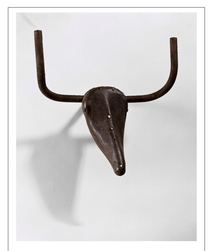
FIGURE 4 | Pablo Picasso, Bull's Head (Tête de Taureau), 1942, Leather and metal, 33.5 x 43.5 x 19 cm, Collection Musée Picasso, Paris. @Succession Picasso. Photo @RMN-Grand Palais (musée Picasso de Paris)/Béatrice Hatala. DACS, London 2015.

native format is composed only of illuminated pixels on an iPad. Here we see something that vividly appears as a puddle-filled country lane in spring and yet is also just as evidently a series of marks made with digital ink on a screen. The fact we see a vivid natural scene made of wiggly digital lines, just as we see Rembrandt and all the textures of his clothing composed of inky scratches, is part of what makes these images fascinating to look at, and part of what makes them works of art.<sup>4</sup>