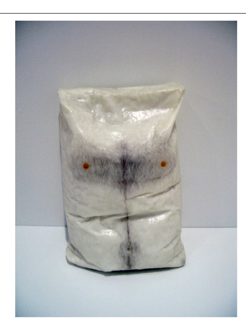
FIGURE 9 | Robert Gober, Untitled , 1990, Beeswax, pigment, and human hair, 60 x 44 x 29 cm, San Francisco Museum of Modern Art. Photograph by the author. @Robert Gober, Courtesy Matthew Marks Gallery.

Jews who died in the Holocaust of World War II (Figure 10). The work was eventually unveiled in 2000 and stands in Judenplatz in the city center. Also known as the "Nameless Library," the memorial appears at a distance to be an ominous bunker robustly constructed from blocks of masonry, but when approached turns out to be a finely cast impression of hundreds of books on library shelves. These books, and the imprint of heavy doors, all occupy the space we would occupy if standing inside this imaginary library. Everything is present only by negation. Concrete, which