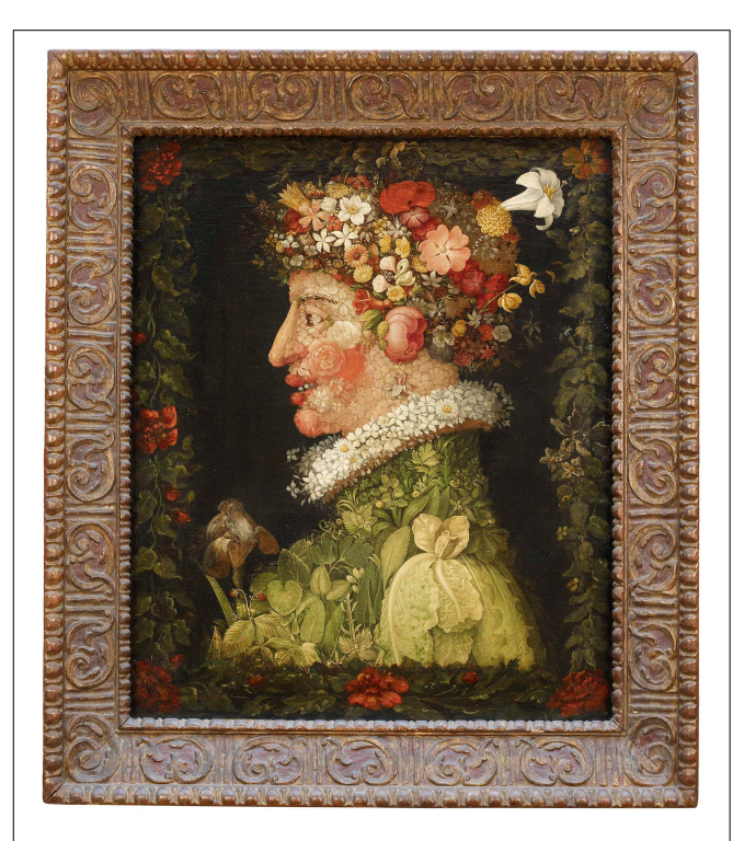
FIGURE 7 | Giuseppe Arcimboldo, The Spring, 1563, Oil on oakwood, 66 x 50 cm, Musée du Louvre, Paris.

Looking at the example from Musée du Louvre in Paris in Figure 7 , we are aware of several distinct representational layers co-existing in the same plane: the painted surface, the