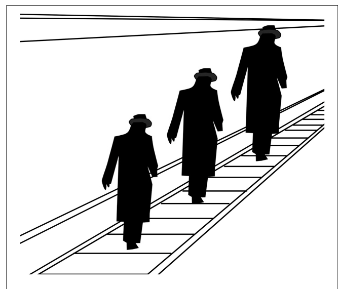
FIGURE 6 | The "men in a tunnel illusion." Based on the image included by Ernst Gombrich in Art and Illusion .

notion of "seeing-as," derived from Wittgenstein, later elaborated into the notion of "seeing-in." Wollheim describes seeing-as in terms of the capacity to see one thing as another. For example, when I mistake a bag on a chair for a cat I see the bag as a cat. In such a case, there is no twofold quality to the perception. In the case of seeing-in, however, "...I can simultaneously be visually aware of the y that I see in x and the sustaining features of this perception." (p. 213) In support of his twofold thesis, and against what he takes to be Gombrich's position that we can only alternate between attending to the depiction and its substrate, Wollheim describes the aesthetic experience of looking at great paintings: