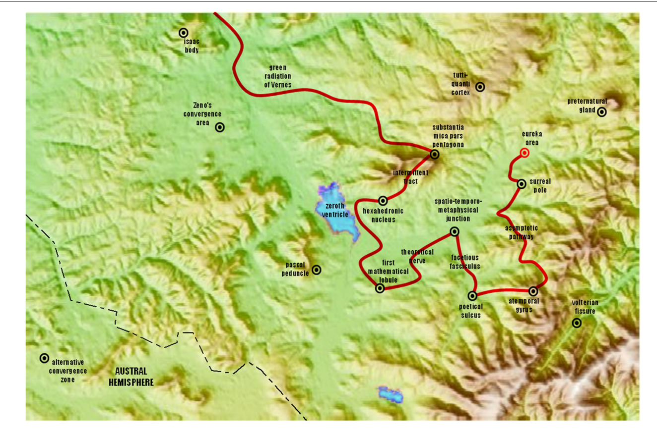
FIGURE 1 | A teasing figure aimed at marking difference between directionality in well-formed Shannonian systems (as in this imaginary brain map) and in complex systems such as the brain. In the latter, direction is less intuitive past immediate spatial and

temporal neighborhoods, and it can reverse across spatial scales of observation (Tognoli and Kelso, 2013). The question is highly relevant though, when one is concerned with where and how to effect changes in the system.