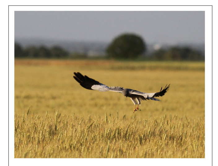
FIGURE 1 | Picture of a Montagu's harrier ( Circus pygargus ) hunting a big green grasshopper in a wheat field in the Long Term Ecological Research Network site "Plaine et Val de Sèvre". This shows that agricultural farmlands provide a suitable habitat for species other than the main crop, opening up new possibilities for resource and pest control by using the natural functions of farmland biodiversity.

"Ecological intensification" was originally defined as the process of increasing crop production to satisfy future food demand while meeting acceptable standards of environmental quality (Cassman, 1999, 2008; Garnett et al., 2013). Its aim is to maximize the primary production per unit area without compromising the ability of the system to sustain its productive capacity. However, ecological intensification can be more than simply a form of agricultural intensification that preserves the environment by making best use of environmental goods and services (Pretty, 2008; Bonny, 2011). It is based on management of ecosystem processes rather than fossil fuel inputs by (i) integrating biological and ecological processes into food production processes and (ii) minimizing the use of non-renewable inputs. In this sense, "ecological intensification" of agriculture is based on the principles of persistence and resilience of the agroecosystem and the principle of autarchy, i.e., the capacity to deliver outputs from inputs and resources acquired from within the system boundaries (Pretty, 2008; Power, 2010). One way to maximize production through ecological intensification is to manage organisms providing regulation services such as pest control, pollination and soil nutrients (Bommarco et al., 2013).