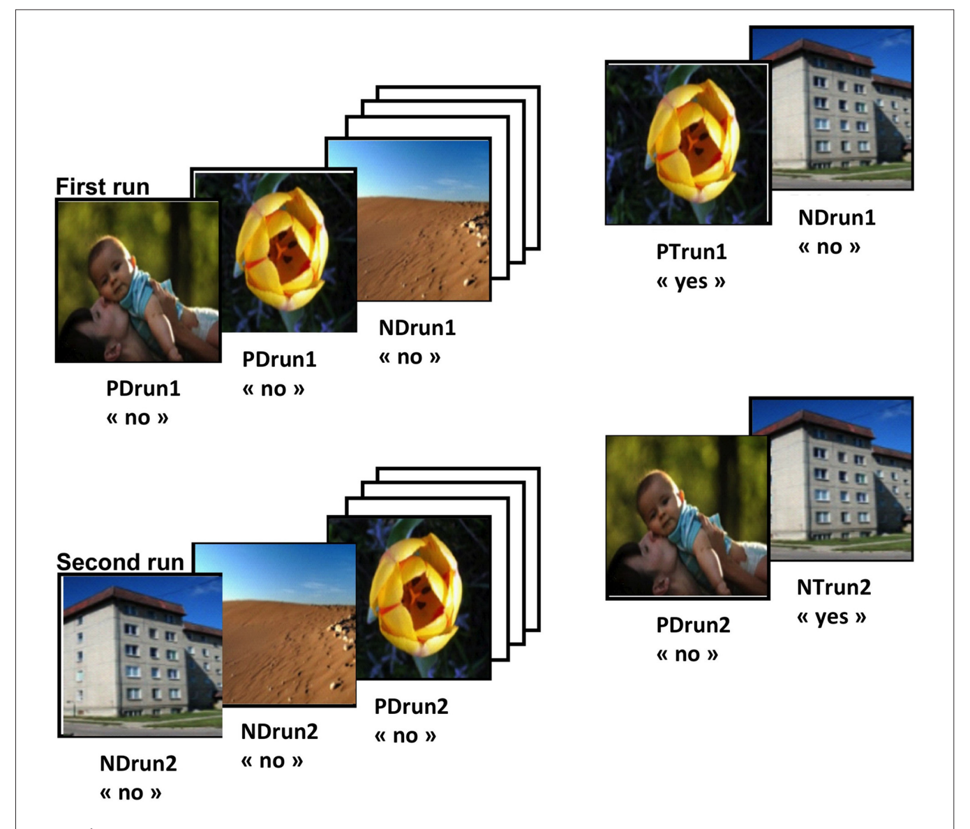
FIGURE 1 | Task design. Each block was composed of two runs. Positive Distracters (PD) and Neutral Distracters (ND) are positive and neutral images that are presented for the first time within a run, respectively. Positive Targets (PT) and Neutral Targets (NT) are positive and neutral images that are repeated within the same runs, respectively. For abbreviations see Table 1 .

ongoing run by pressing the right button with the right middle finger to indicate first presentations (distracters; "No, not yet seen") within the run and the left button with the right index for repeated images within the ongoing run (targets; "Yes, already seen."). The first run measures learning and recognition and can be solved on the basis of familiarity alone. In the present study, this run thus contained the following stimulus types: positive distracters (PD), PDrun1; neutral distracters (ND), NDrun1; positive targets (PT), PTrun1; neutral targets, NTrun1.