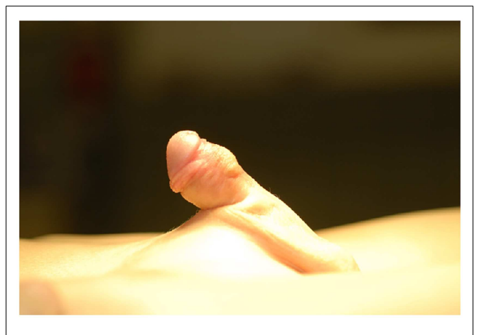
FIGURE 5 | Appearance of the penis 3 months post DOPF.

The creation of flaps from the dorsal preputial hood and their transfer to the ventral side of the penis have been used for more than a century and are most commonly created by splitting the prepuce in the midline and rotating it to both sides to reach the ventral surface of the penis (11). The Byars technique has been