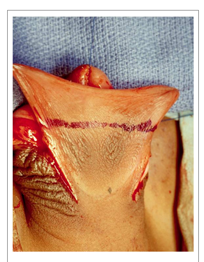
FIGURE 1 | After the penis is degloved, a superficial incision is made at the junction between the dorsal shaft skin and the prepuce (blue line). If there is some degree of scrotal transposition, superficial incisions are made to separate the scrotum from penile shaft. This is important to have enough dorsal skin and to correct the transposition.

Ludwikowski and González Total preputial flap