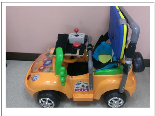
FIGURE 1 | The modified ride-on toy car.

The ride-on car training sessions were conducted at Taoyuan Chang Gung Memorial Hospital using public spaces (e.g., hallways, garden, and food court). The training program was developed based on the previous studies (18, 23). The research team and caregivers discussed the training goal with the OT who