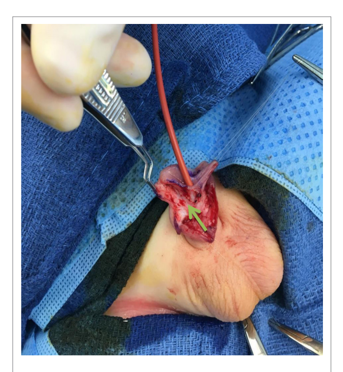
FIGURE 2 | Intraoperative view of the urethral plate dissection. Note the clear delineation of the lateral extension of the urethral plate (green arrow). A traction suture on the inframeatal flap allows for identification of the tissue planes between urethra and glans.

may be associated with a higher rate of complications specifically dehiscence of the prepuce or secondary phimosis (10). No information was found addressing the issue of reconstructing