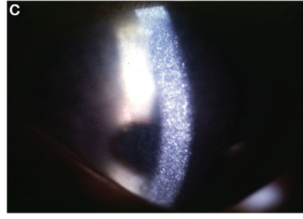
FIGURE 2 | Corneal slit-lamp examination of three patients with nephropathic cystinosis. (A) High magnificent slit beam view of cornea with cystine crystals. (B) Retroillumination showing marked diffuse crystals packed within the cornea. (C) Retroillumination with patient looking down showing the extent of crystal deposition up to the peripheral edge of the cornea. With friendly permission from Clinical Ophtalmology, Dove Press (27).

in cystinosis. Possibly, it might be that intra-osseous cystine crystals lead to falsely elevated X-ray absorptiometry levels making X-ray absorptiometry an ineffective tool to assess fracture risk in cystinosis patients (29). Three-dimensional peripheral computed tomography should be the preferred method to assess fracture risk in growth-retarded children with (chronic kidney) disease (30).