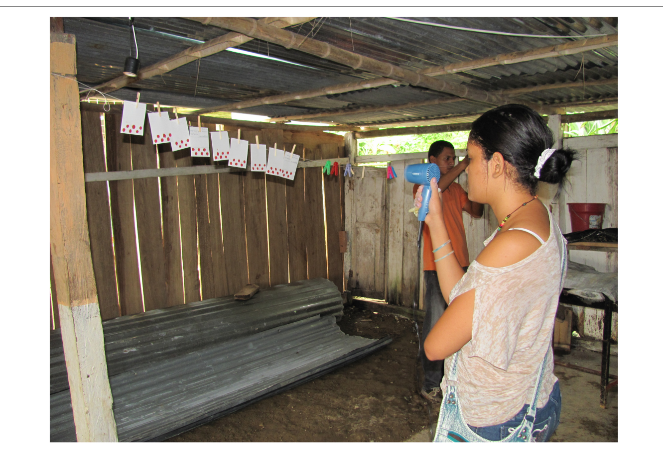
FIGURE 1 | Study settings. Dried blood spots drying on filter papers.

to proceed to the next steps. Hence, a biologist (FF) performed an electrophoresis on a polyacrilamide gel 4–18% on the eluated DBS samples of four individuals with stool microscopy positive for S. stercoralis (Supplementary Data Sheet 1). The elution was conducted overnight at room temperature in a buffer containing PBS, 0.05% tween 20 and protease inhibitor. The electrophoresis run for 3.5 h at 89 V. The bands corresponding to the IgG heavy (76 KDa) and light (26 KDa) chambers were evaluated to confirm the good preservation of the samples.