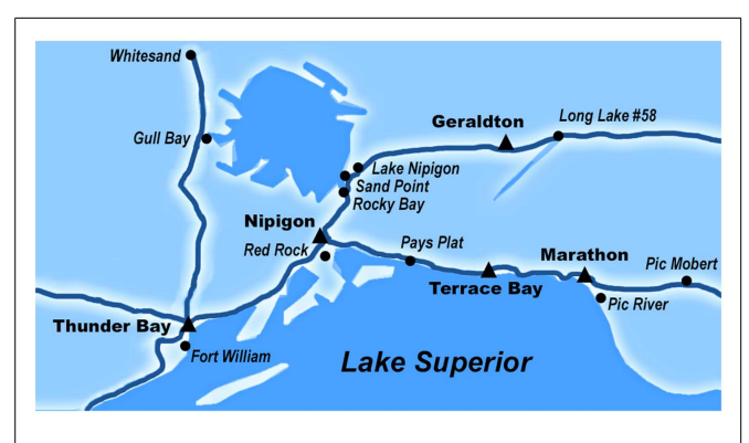
FIGURE 2 | The map of our partner communities of the Robinson-Superior Treaty in Northwestern Ontario, Canada. Our partner communities are contained in the Thunder Bay District census area, which has a land area of 103,720 km². All of our partner communities are accessible by road. Pic Mobert First Nation is the farthest distance away from the study center in Thunder Bay at approximately 360 km east of the city, and Fort William First Nation is adjacent to Thunder Bay.