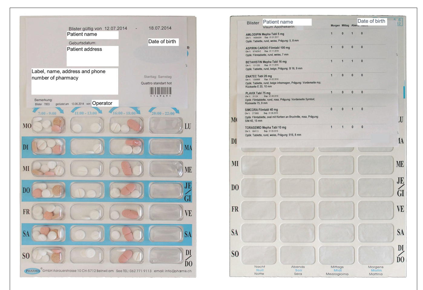
FIGURE 1 | Multidrug punch card. Front side (left): 28 plastic cavities with visible packaged medication and labeling with patient and pharmacy information. Back side (right): 28 cavities sealed with foil and marked with indication of dosing time (morning, lunch, evening,

Multidrug punch cards are disposable frame cards with plastic cavities, sealed with a foil backing, with typically 28 compartments, filled by pharmacy staff, by a specialized company or an automated system ( Figure 1 ). They provide a visual reminder for medication intake, the possibility of adherence self-monitoring and the saving of time, costs, healthcare resources (e.g., home care nursing), and medication waste. Multidrug punch cards were introduced in Switzerland in 2002 together with a documentation software for community pharmacies (Pharmis GmbH).