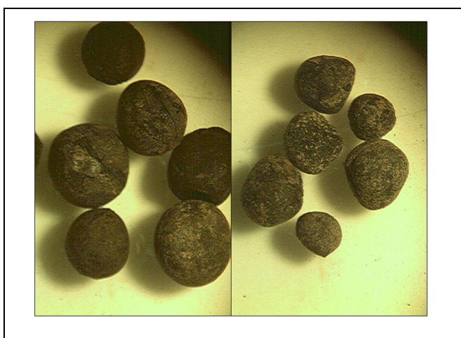
FIGURE 1 | Charred seeds of pea (left) and bitter vetch (right) from Hissar, south-east Serbia, cca 11th century BC.

The first reported successful and attested extraction of the aDNA from some legume species was done from the charred seeds of pea