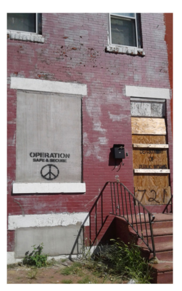
FIGURE 2 | Example photographs taken by citizen scientists with the discovery tool application in Camden, New Jersey (September 2016).