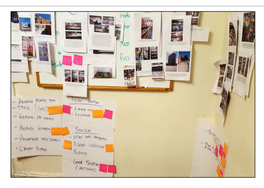
FIGURE 3 | Photograph of theme clusters assembled during Community Meeting 1 in Camden, New Jersey (September 2016).